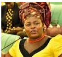
Hon. Jacqueline Amongin

The Honorable Amelia Anne Kyambadde started working in the Ugandan Civil Service in 1979, at the age of twenty-four. She rose to the rank of Principal Private Secretary (PPS) of the President of Uganda. In 2010, she voluntarily resigned as the President's PPS, to run a successful bid to become a member of Parliament. On 27 March 2011, she was appointed Minister for Trade & Industry. On 6 June 2016, she was named Cabinet Minister of Trade, Industry and Cooperatives. She is the Patron and Founder of Twezimbe Development Foundation (TDF), a community-based, non-governmental, organization formed to improve the living conditions of the people of her parliamentary constituency.